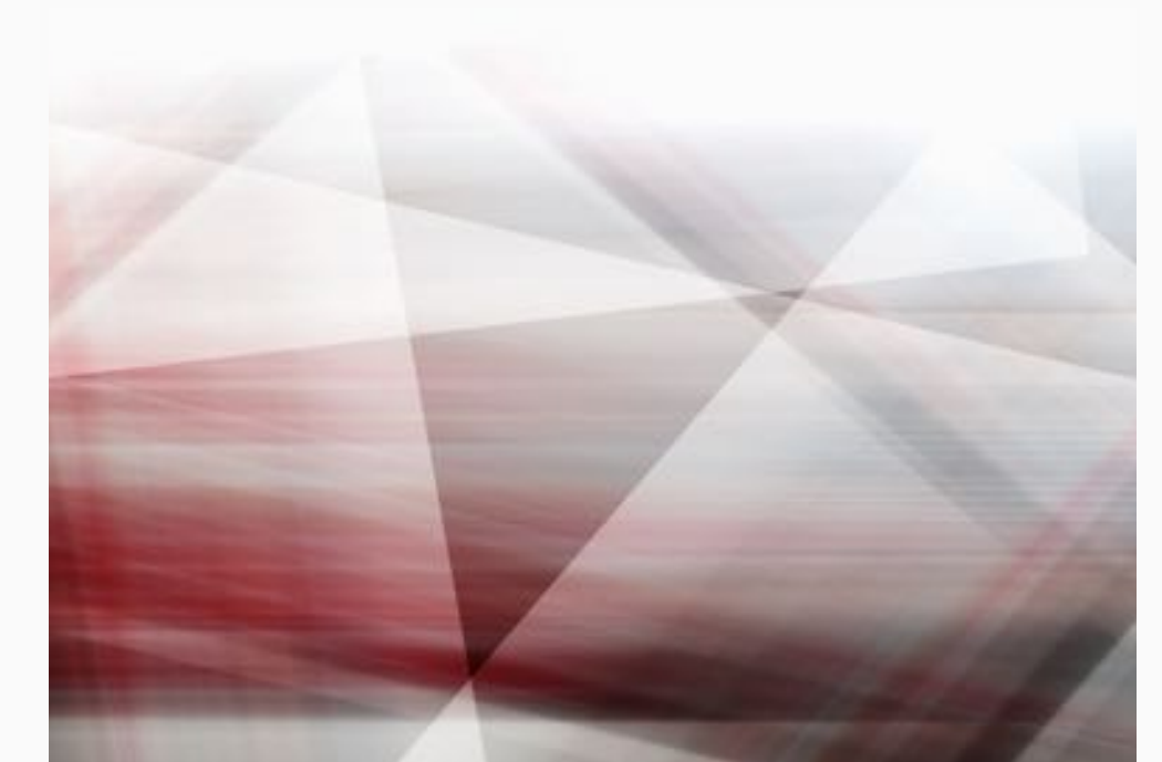
EVERYTHING ELSE Get in Touch