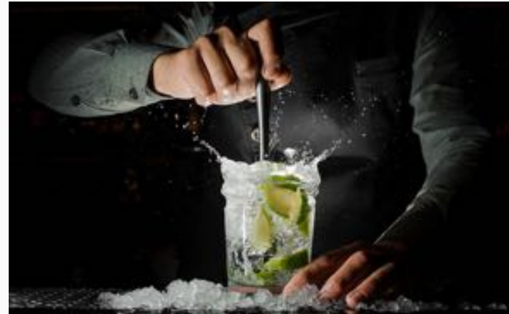
COCKTAILS from $15 each