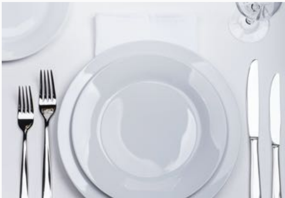
TABLE SETTING from $9 per person