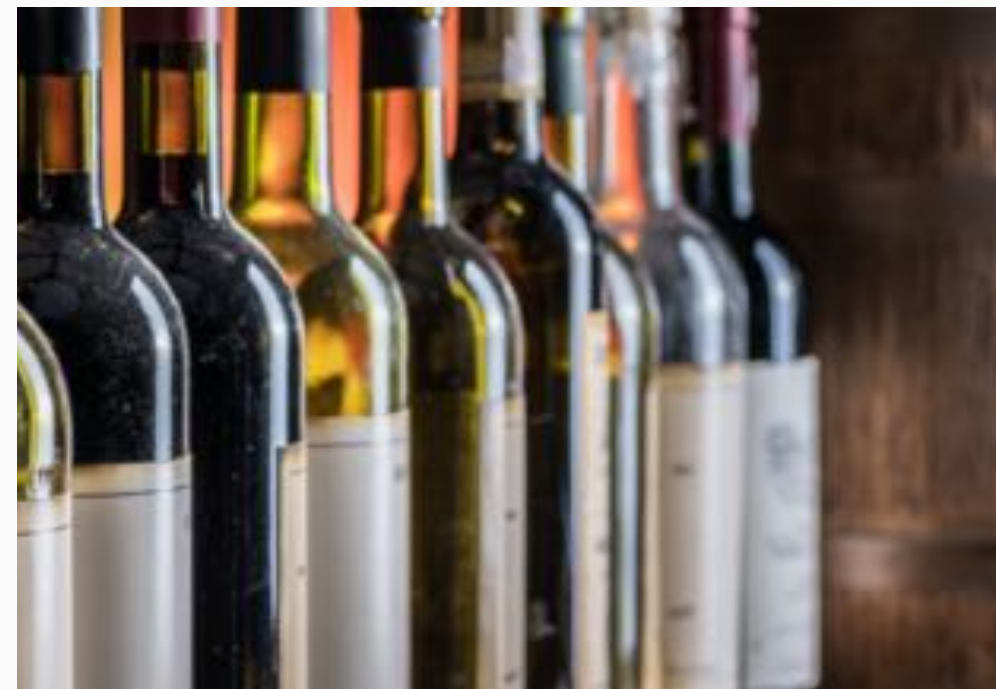
BEVERAGE PACKAGES from $45 per person