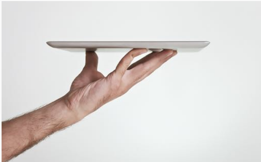
FRONT OF HOUSE STAFF from $49 per hour