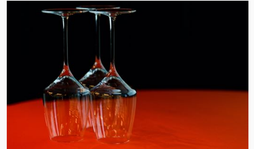
GLASSWARE SET from $6 per person